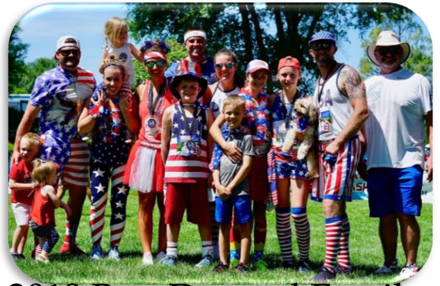
2019 Best Dressed Family